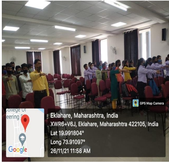
“Pledge taken by faculty and Students.”