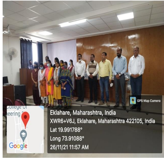
“Pledge taken by faculty and Students.”