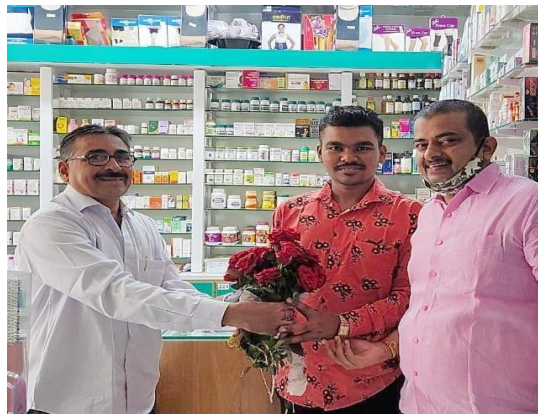
MCOP appreciating the Pharmacy Professional